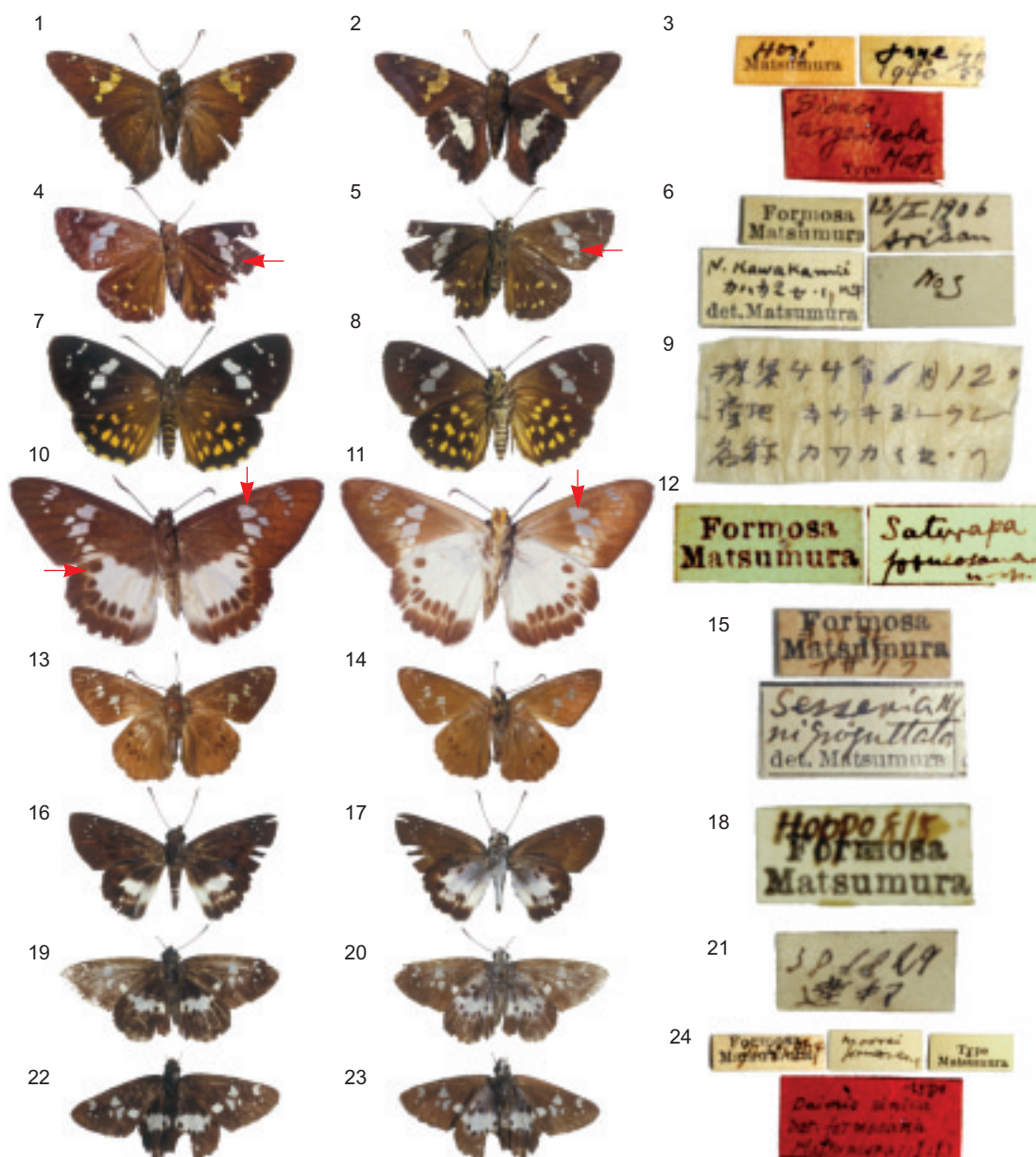
Figs. 1-24. Types of taxa described by Matsumura. 1. Holotype of Bibacis argenteola , upperside; 2. ditto, underside; 3. ditto, labels; 4. lectotype of Notocrypta kawakamii , upperside; 5. ditto, underside; 6. ditto, labels; 7. holotype of Celaenorrhinus taiwanus , upperside; 8. ditto, underside; 9. ditto, labels; 10. lectotype of Satarupa formosana , upperside; 11. ditto, underside; 12. ditto, labels; 13. lectotype of Suastus nigroguttatus , upperside; 14. ditto, underside; 15. labels; 16. holotype of Tagiades menaka var. formosana , upperside; 17. ditto, underside; 18. ditto, labels; 19. lectotype of Daimio niitakana , upperside; 20. ditto, underside; 21. ditto, labels; 22. lectotype of Daimio sinica var. formosana / Daimio sinica var. taiwana , upperside; 23. ditto, underside; 24. ditto, labels. Arrows indicate diagnostic characters. Scale bar = 1 mm.

these articles (23.9.1, 23.9.2, and 23.9.3), the action by Inomata et al. (2000) will be legitimate only after a ruling by the International Commission of Zoological Nomenclature; thus the precedence of Celaenorrhinus ratna Fruhstorfer, 1908 over Notocrypta kawakamii Matsumura, 1907 is yet to be formally established. When Inomata et al.