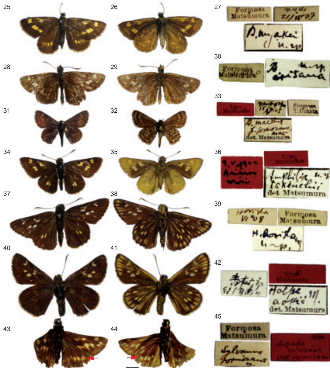
Figs. 25-45. Types of taxa described by Matsumura. 25. Lectotype of Ampittia myakei , upperside; 26. ditto, underside; 27. ditto, labels; 28. holotype of Ampittia arisana , upperside; 29. ditto, underside; 30. ditto, labels; 31. holotype of Aeromachus inachus f. formosanus , upperside; 32. ditto, underside; 33. ditto, labels; 34. holotype of Ampittia takeuchii , upperside; 35. ditto, underside; 36. ditto, labels; 37. lectotype of Halpe horishana , upperside; 38. ditto, underside; 39. ditto, labels; 40. holotype of Halpe aokii , upperside; 41. ditto, underside; 42. ditto, labels; 43. holotype of Augiades sylvanus var. formosana , upperside; 44. ditto, underside; 45. ditto, labels. Arrows indicate diagnostic characters. Scale bar = 0.5 mm.

Evans (1949) treated myakei as a subspecific