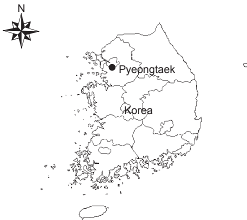
Fig. 1. Survey site for breeding ecology of Grey Herons, Pyeongtaek, Korea.

The clutch size, initial brood size, and final brood size were determined by examining openly visible nests on trees. A ladder was used to view nests not visible from the ground. The average clutch size, initial brood size, and final brood size were compared between years. For fledglings, we considered chicks as having successfully fledged when they were more than 4 wk post-