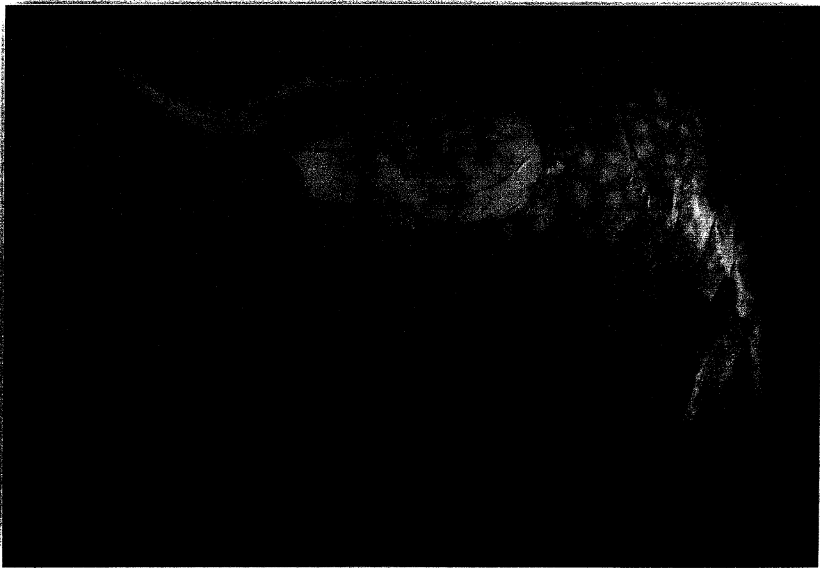
Plate I. Eugonatonotus crassus (A. Milne Edwards, 1881), female 106.3 mm with lateral carapace slightly broken.

above post-orbital margin) and 7-8 ventral teeth. Post-rostral carina bearing 1 large fixed tooth and 10-12 small movable teeth. Rostral carina formed a crest at region above orbit. Antennal and branchiostegal spines well-developed extending backwards as two strong longitudinal carinae on lateral carapace. Dorsal midline of abdominal tergite III strongly elevated at anterior 2/3 of non-articulated surface and terminated in small tooth. Posterior margins of abdominal tergites III to V provided with pair of submedian spines, that of IV also armed with larger median spine. Telson with 2 pairs of spines dorso-laterally, terminated in pointed spine and provided with two pairs