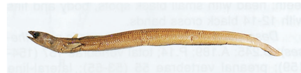
Fig. 2. Ariosoma anagoides .