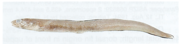
Fig. 1. Ariosoma anago .

Sensory pores on head: about 8-12 (mostly 8-9) on preoperculomandibular canal, 7 on infraorbital