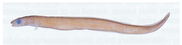
Fig. 4. Ariosoma shiroanago major .