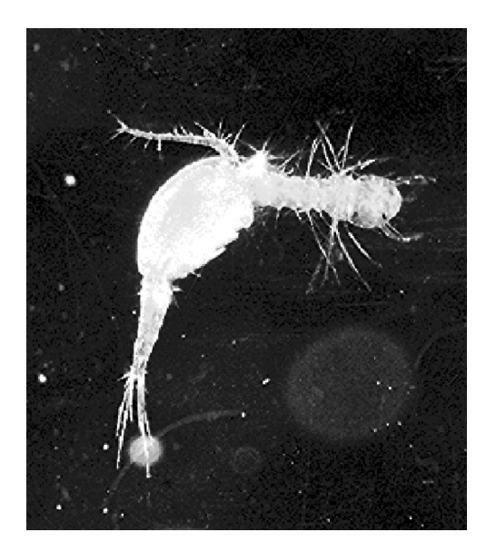
Fig. 2. Image of the cyclopoid copepod, Mesocyclops thermo-cyclopoides handling mosquito larvae of Culex quinquefascia-tus .

1994a b, Brown et al. 1991a b, Kay 1996, Kay et al. 1992, Mittal et al. 1997, Kumar and Rao 2003). Furthermore, in many ponds and small water bodies, a strong negative association has been reported between Mesocyclops sp. and larvae of An. albimanus (Marten et al. 1989, Zoppi De Roa et al. 2002). The ability of certain cyclopoid copepods to destroy larval mosquitoes was first noted in 1938 by Hurlbut. These "water fleas" were seen preving on newly hatched larvae. Field experiments in Rongaroa (French Polynesia) later demonstrated that Mesocyclops sp. can be used in interventions against Ae. aegypti (Rivière et al. 1987). Field trials have been conducted to determine whether copepods can usefully destroy larval Stegomyia mosquitoes. Macrocyclops albidus was released into each of about 200 tires arranged in 2 stacks of about 100 discarded tires each located near New Orleans (Marten 1990a b). A 3rd stack remained untreated. Larval Ae. albopictus that had been numerous in the treated tires at the beginning of the experiment virtually disappeared within 2 mo. Adults disappeared about 1 mo later and remained scarce for at least another year (Marten 1990b, Marten et al. 1994a b, Nam et al. 1998). These predators, however, did not reduce the abundance of the mosquito, Culex salinarius. Field trials are currently being conducted in different parts of the world to determine whether this is a good way of preventing the transmission of diseases. Preliminary results have been encouraging.