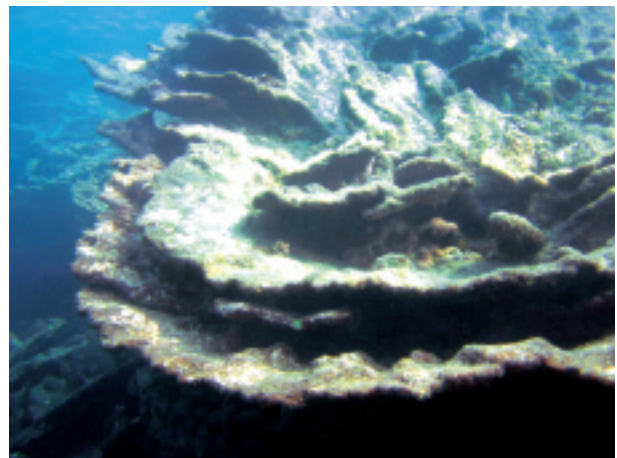
Fig. 3. Large dead colonies.