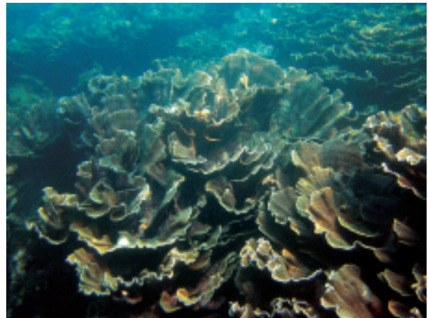
Fig. 2. Large stands of Turbinaria mesenterina .