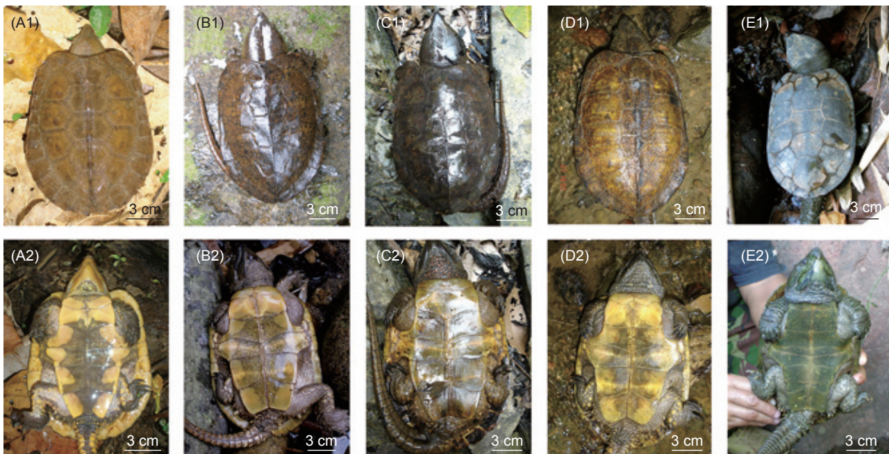
Fig. 2. The different color morphologies of the carapaces of adult big-headed turtles; (A1) brown, (B1) reddish-brown, (C1) olive, (D1) yellowish-brown and (E1) the new morph, dark gray; all with a squared-off front and rounded back end. The plastrons are usually (A2, D2) yellow, (B2) brownish, (C2) olive with yellowish and (E2) the new dark gray morph. These specimens are from (A) the Mae Samard Watershed Management Unit, Mae Hong Son Province in the Salawin river basin, (B) the Umphang Wildlife Sanctuary, Tak Province in the Mae Klong river Basin, (C) the Tad Mok National Park, Phetchabun Province in the Pasak river basin, (D) the Pha Daeng National Park, Chiang Mai Province in the Kok river basin and (E) the Phu Suan Sai National Park, Loei Province in the Khong river basin.

A comparison of historical data on the distribution of P. megacephalum in Thailand from the literature and museum specimens with the results of our current field surveys show some changes in occurrence over time. We surveyed a