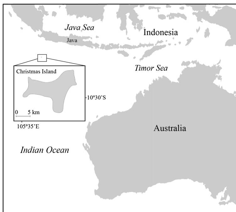
Figure 1 Geographic location of Christmas Island, Indian Ocean.

During the breeding period of 2007 (September to October), we collected 0.5 ml of blood from incubating and chick-rearing adults of both species. In red-tailed tropicbirds, we sampled 19 incubating birds (10 males and 9 females) and 21 chick-rearing adults (10 males and 11 females). In brown boobies, we sampled 19 incubating birds (10 males and 9 females) and 73 chick-rearing adults (37 males and 36 females). All individuals were sampled only once, either during incubation or during chick rearing. Blood was taken from the brachial vein using a 0.5-ml insulin syringe and preserved in 70% ethanol. Blood extraction is a method commonly used in bird studies that apparently have not negative effect