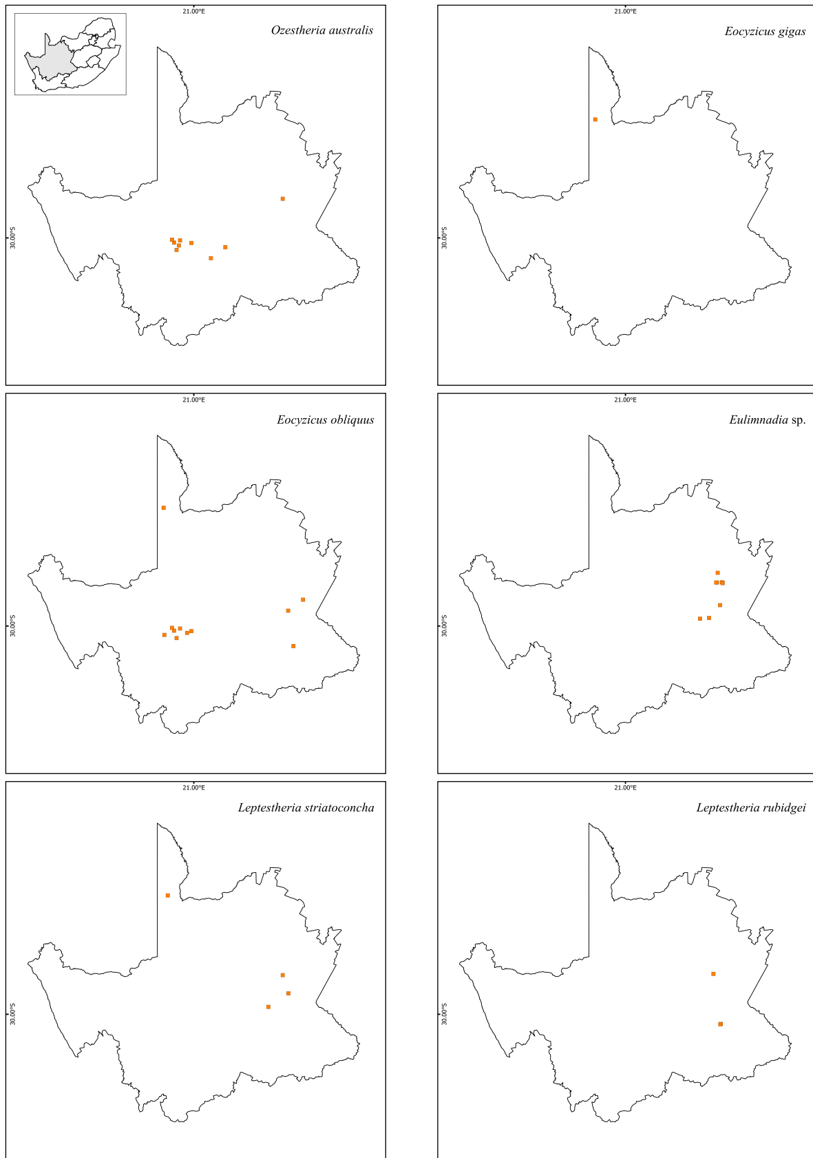
Fig. 2. The distribution of clam shrimp species in the Northern Cape, derived from the current study.