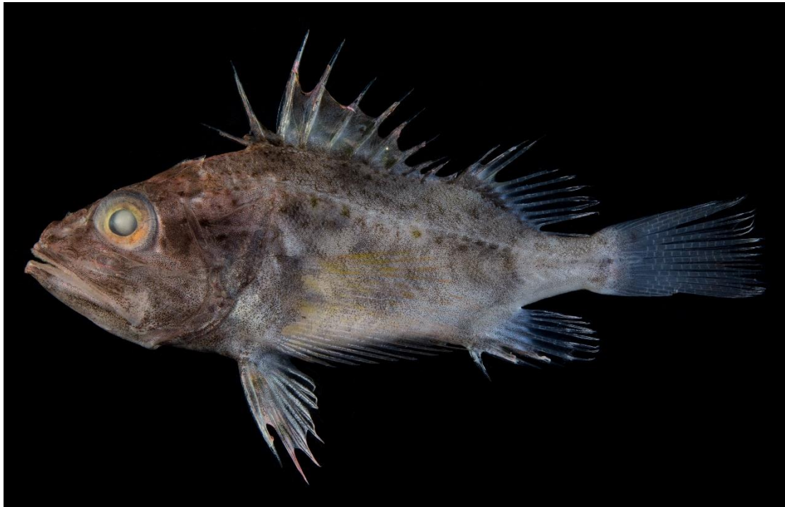
Setarches guentheri , DOS08437, 57.5 mm SL, OM949702.