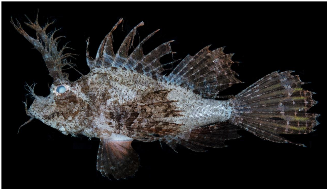
Pteroidichthys amboinensis , DOS08572, 44.0 mm SL, OM949646.