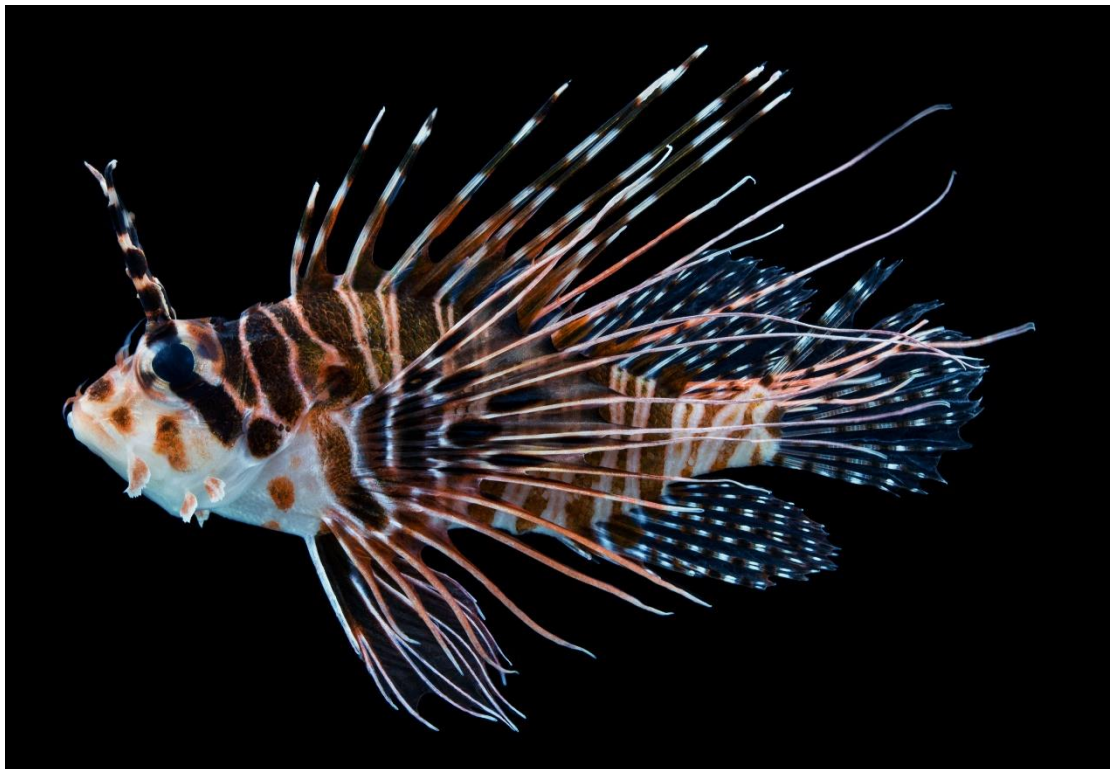
Pteropterus antennata , DOS06134-1, 62.0 mm SL, OM949648.