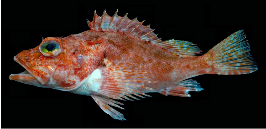
Pontinus tentacularis , DOS06534, 139.0 mm SL, OM949644.