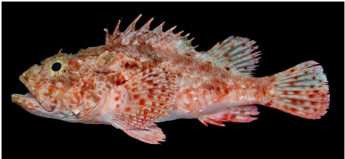
Scorpaena neglecta , DOS07029-1, 197.0 mm SL, OM949659.