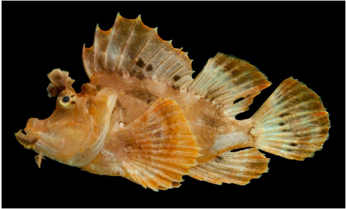
Rhinopias eschmeyer , DOS07974, 73.5 mm SL, OM949655.