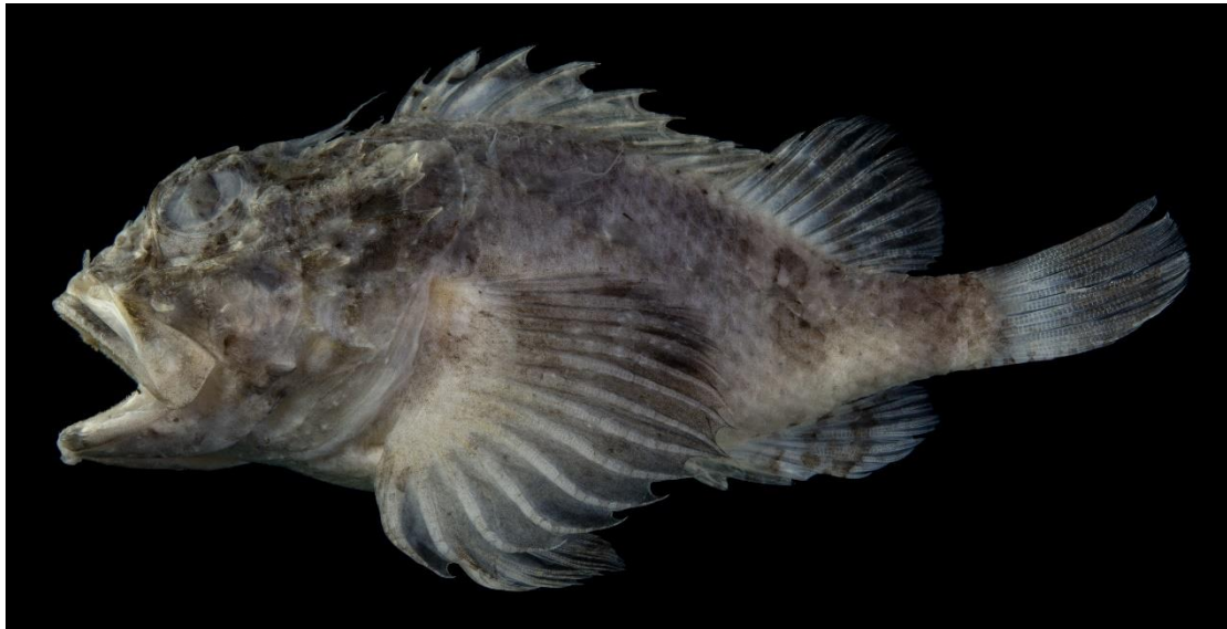
Scorpaenopsis cotticeps , NMMB-P035560-1, 73.4 mm SL, NA.