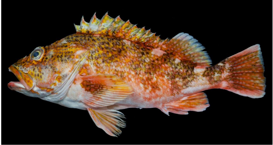
Sebastiscus vibrantus , DOS08057-1, 276.0 mm SL, OM949700.