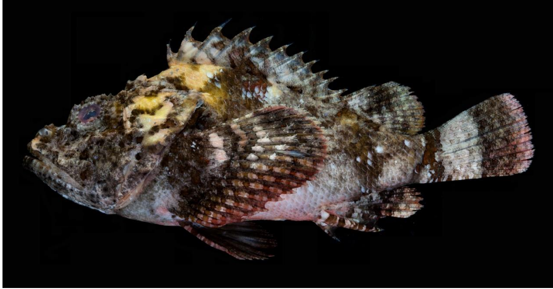
Scorpaenopsis neglecta , DOS06488-1, 120.0 mm SL, MZ508516.