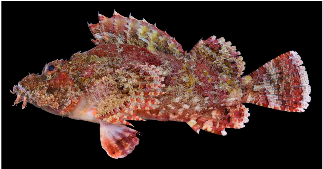
Scorpaenopsis papuensis , DOS08233, 149.0 mm SL, NA.