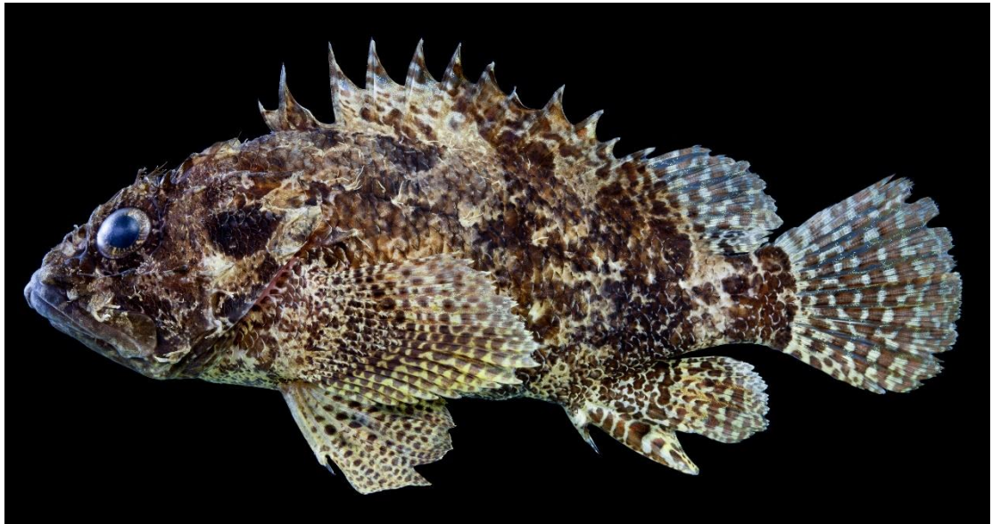
Scorpaenodes guamensis , DOS06129-12, 83.0 mm SL, MZ317595.