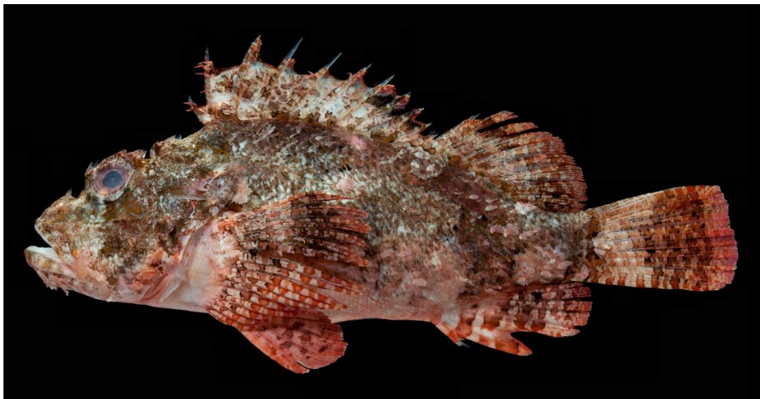
Scorpaenopsis venosa , DOS06489, 180.0 mm SL, NA.