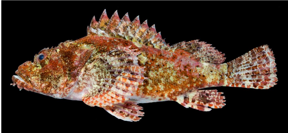
Scorpaenopsis cirrosa , DOS06523, 195.0 mm SL, OM949666.