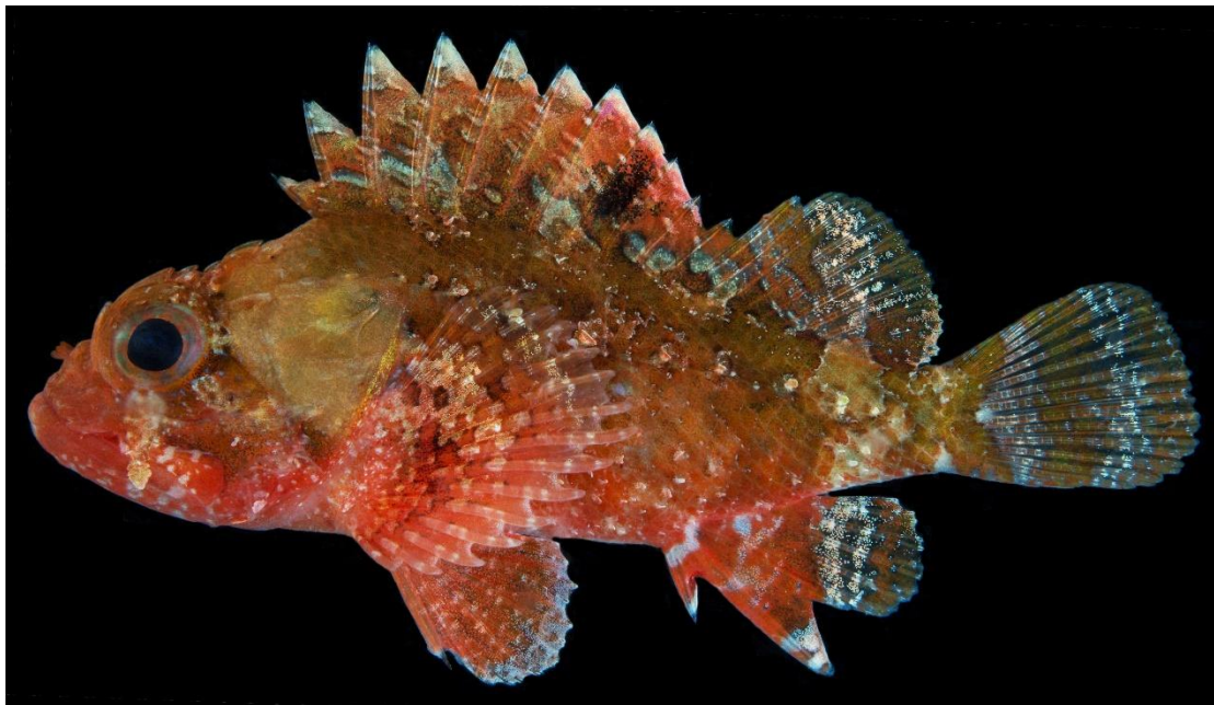
Parascorpaena mcadamsi , DOS08415-3, 37.5 mm SL, OM949641.