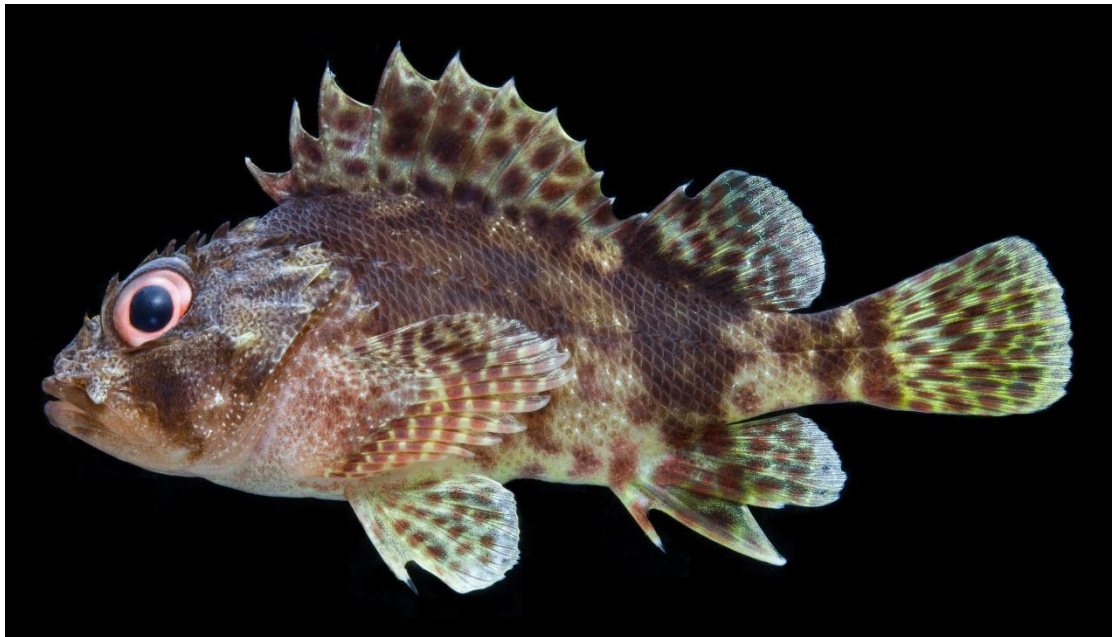
Sebastapistes tinkhami , DOS08007, 47.0 mm SL, OM949693.