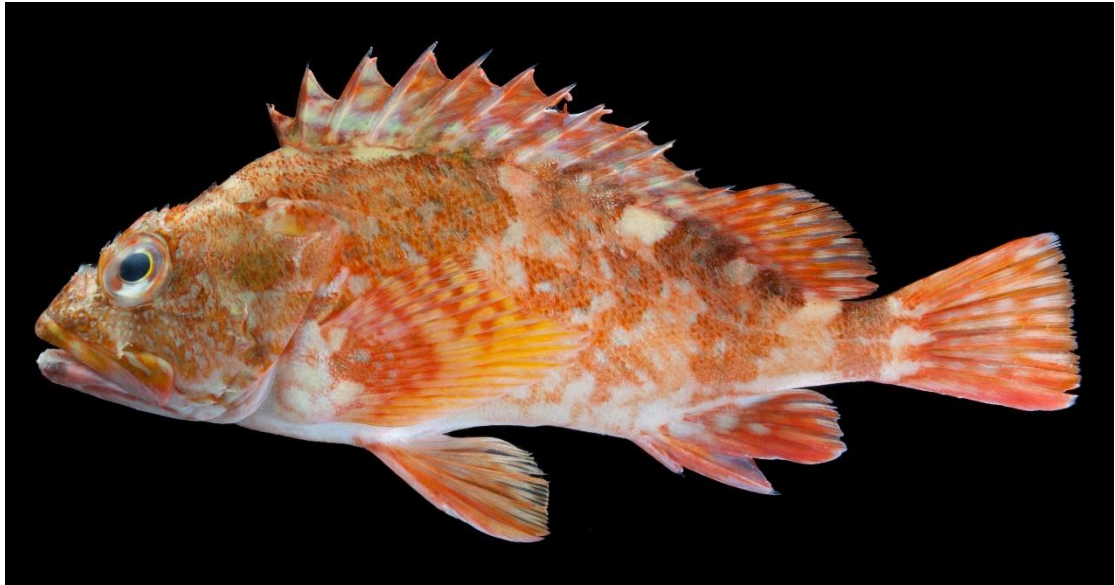
Sebastiscus marmoratus , DOS07990, 119.0 mm SL, OM949697.