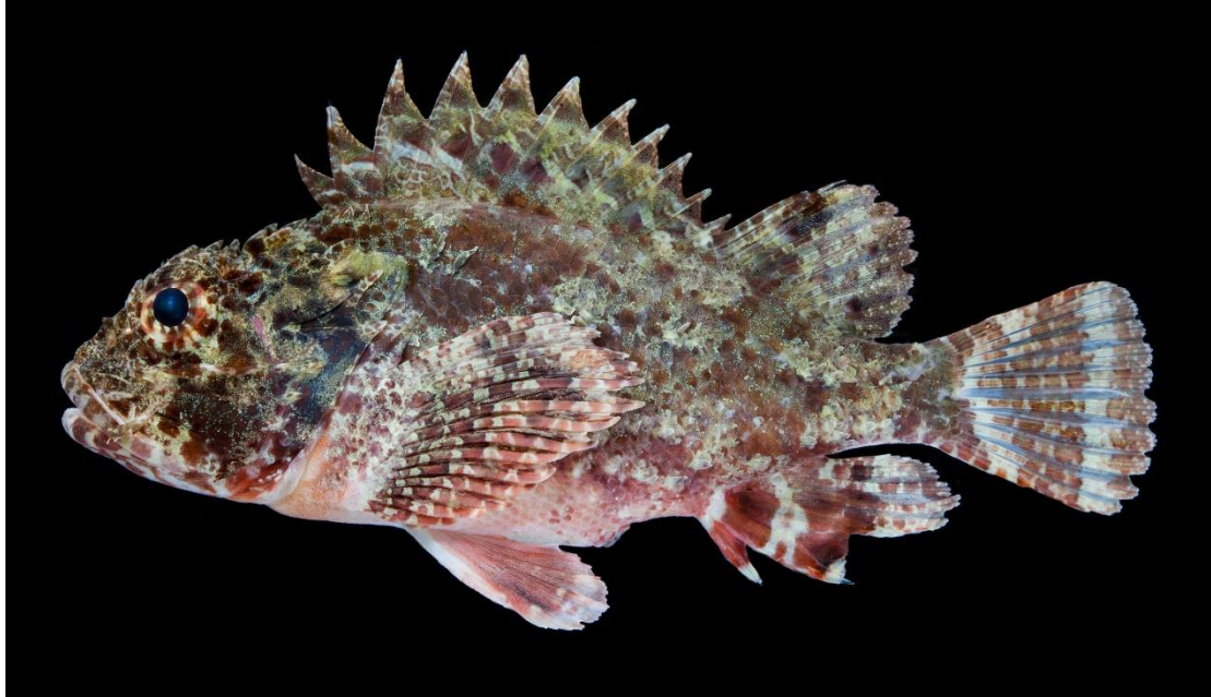
Parascorpaena aurita , DOS06547-2, 102.0 mm SL, NA.