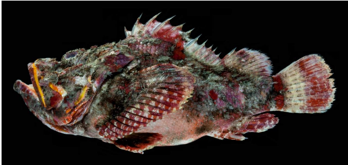
Scorpaenopsis diabolus , DOS06487, 182.0 mm SL, OM949668.