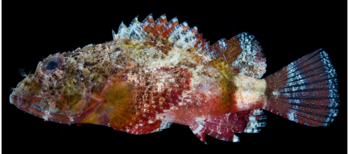
Scorpaenopsis vittapinna , DOS08448, 43.5 mm SL, OM949684.