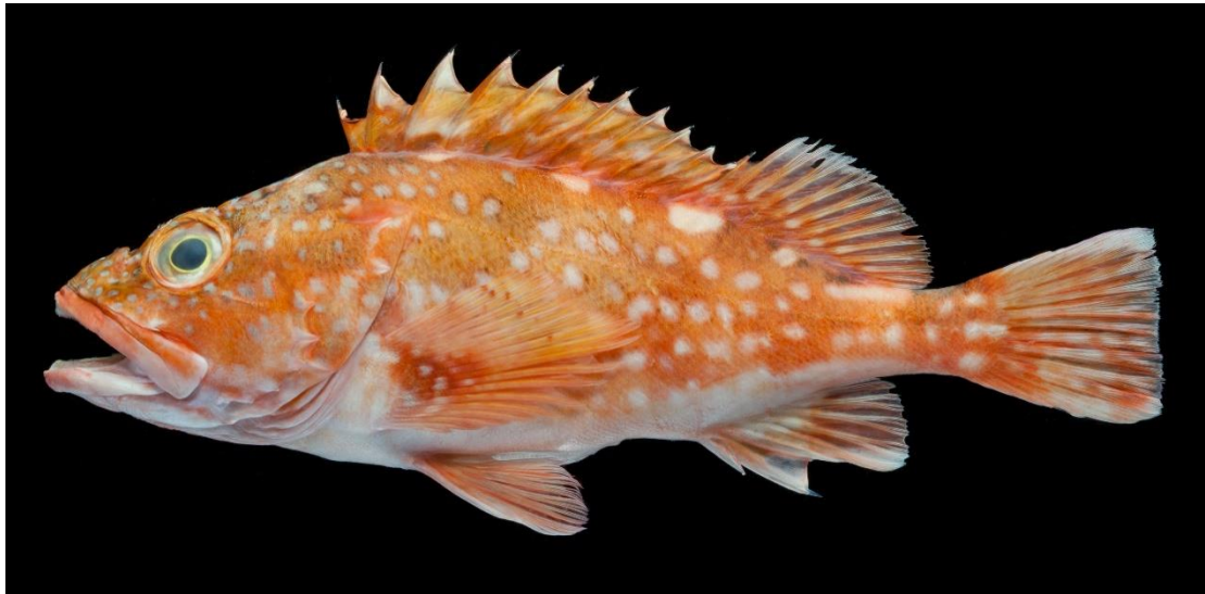
Sebastiscus tertius , DOS07989-1, 134.0 mm SL, OM949698.