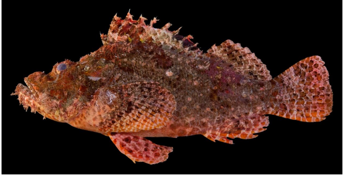
Scorpaenopsis oxycephala , DOS08579, 359.0 mm SL, OM949675.