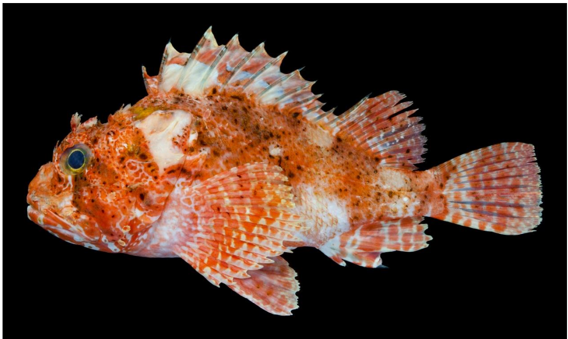
Scorpaena pepo , DOS06587-2, 167.0 mm SL, OM949662.