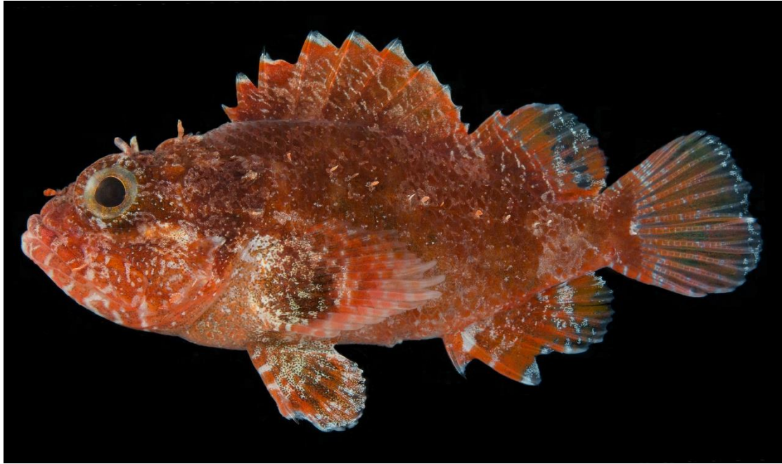
Sebastapistes fowleri , DOS08426, 28.0 mm SL, OM949688.