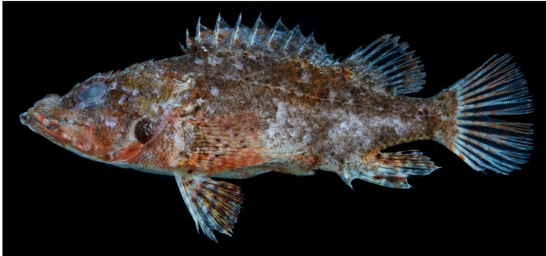
Scorpaenodes albaiensis , NMMB-P036064, 78.0 mm SL, ON054337.