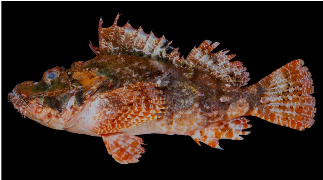
Scorpaenopsis orientalis , DOS08079, 253.0 mm SL, OM949671.