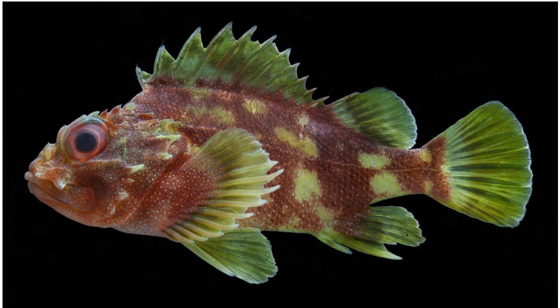
Sebastapistes cyanostigma , DOS06294, 52.5 mm SL, OM949685.