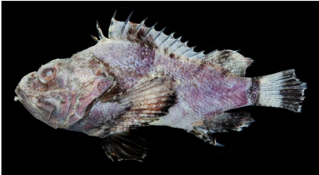
Scorpaenopsis macrochir , DOS08137, 77.0 mm SL, OM949670.