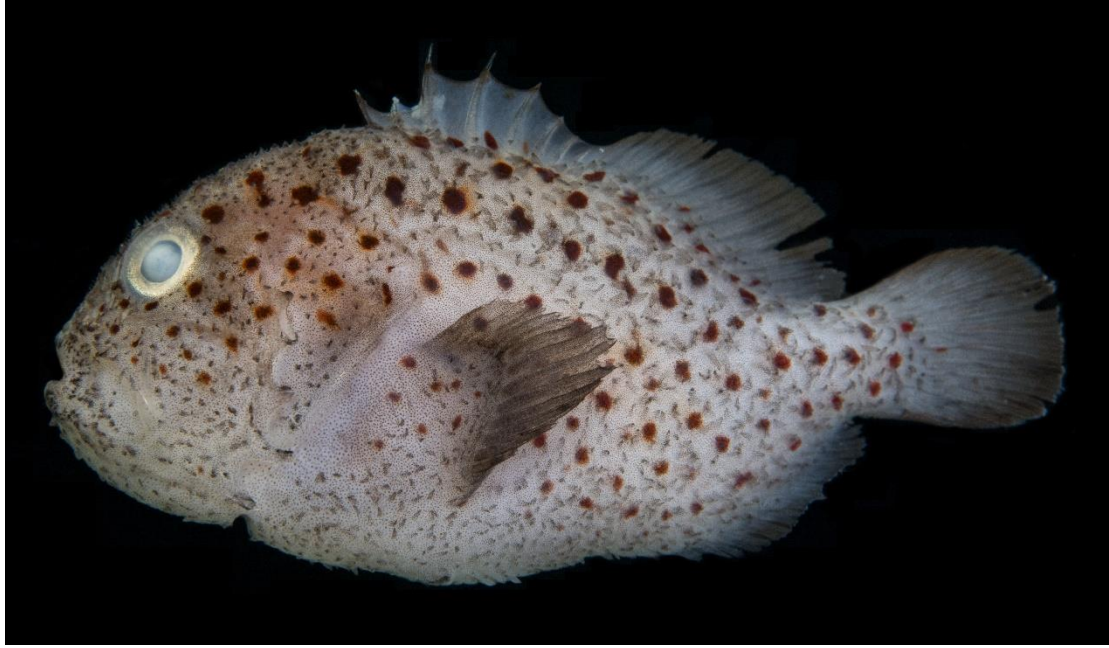
Caracanthus maculatus , DOS08359, 23.5 mm SL, OM949622.