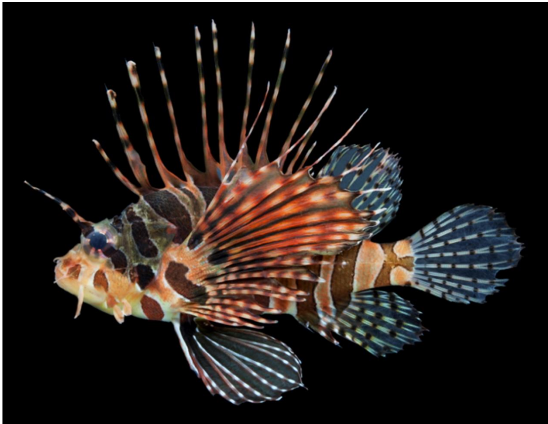
Dendrochirus zebra , DOS06343-1, 76.0 mm SL, MZ317574.