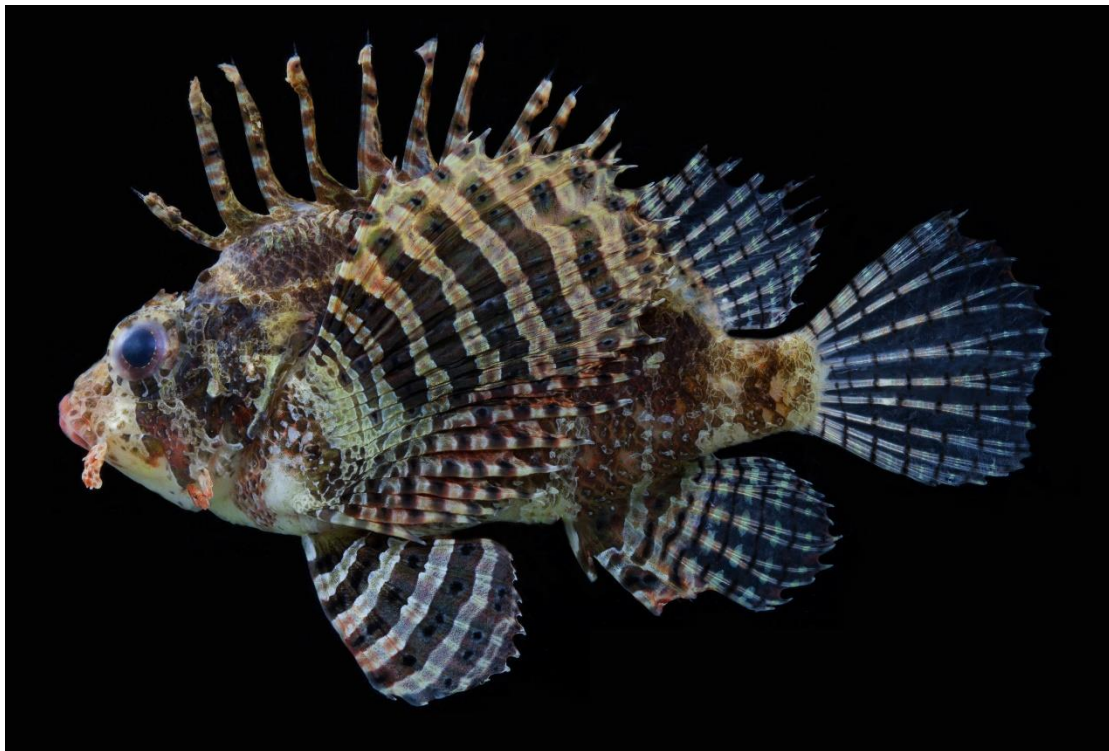
Neochirus brachypterus , DOS06342, 69.0 mm SL, MZ317573.