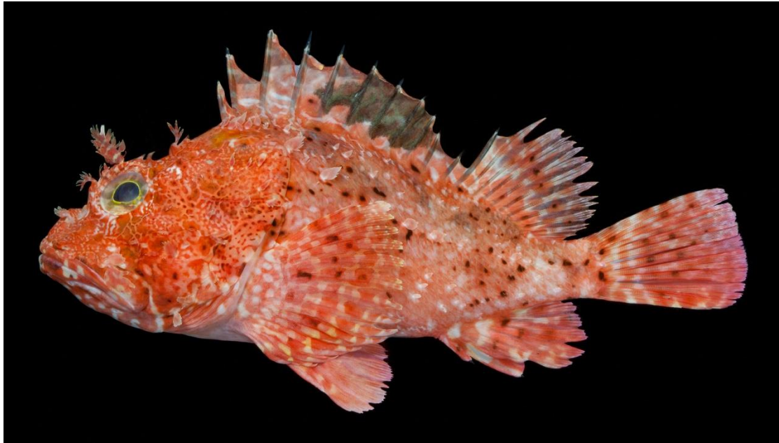
Scorpaena onaria , DOS06587-1, 155.0 mm SL, OM949661.