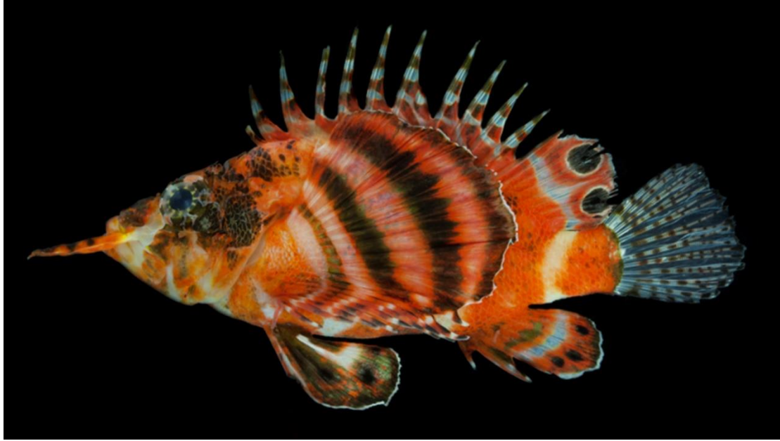
Nemapterois biocellatus , DOS06340-2, 99.0 mm SL, MZ317571.