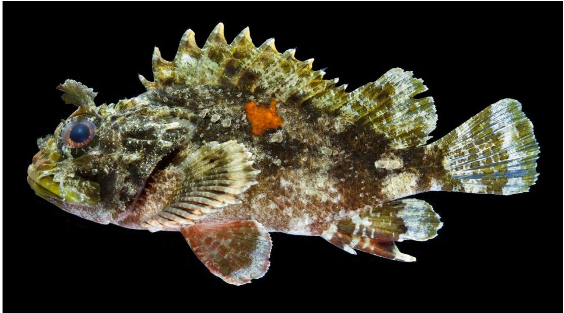
Parascorpaena mossambica , DOS08024, 83.8 mm SL, NA.